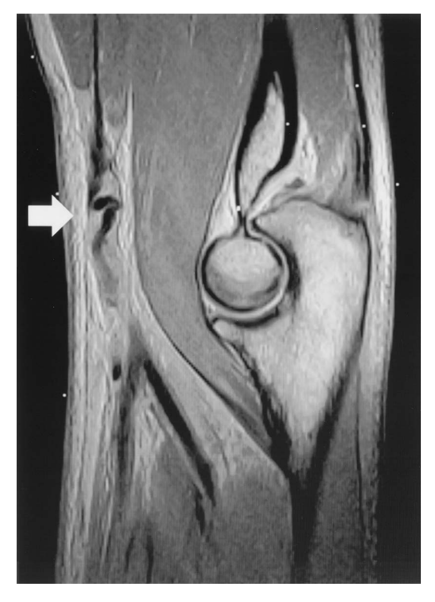
Fig. 1. MRI sagittal fast spin-echo image of a ruptured distal biceps tendon.