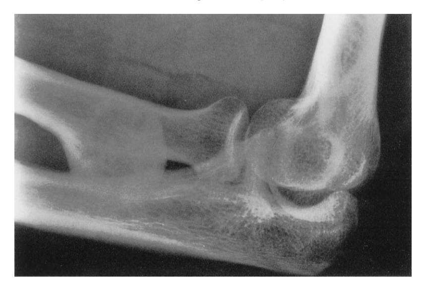
Fig. 4. Radioulnar synostosis associated with two-incision technique ( From Morrey BF. Injury of the flexors of the elbow: biceps in tendon injury. In: Morrey BF, editor. The elbow and its disorders. 3rd edition. Philadelphia: W.B. Saunders Co.; 2000. p. 474; with permission.)

ruptured failed at the suture-tendon interface 2 weeks postoperatively. The second failed 3 months after repair, but did not undergo reoperation, so the site of failure is unknown. Both were initially reattached using the two-incision technique [40,41].