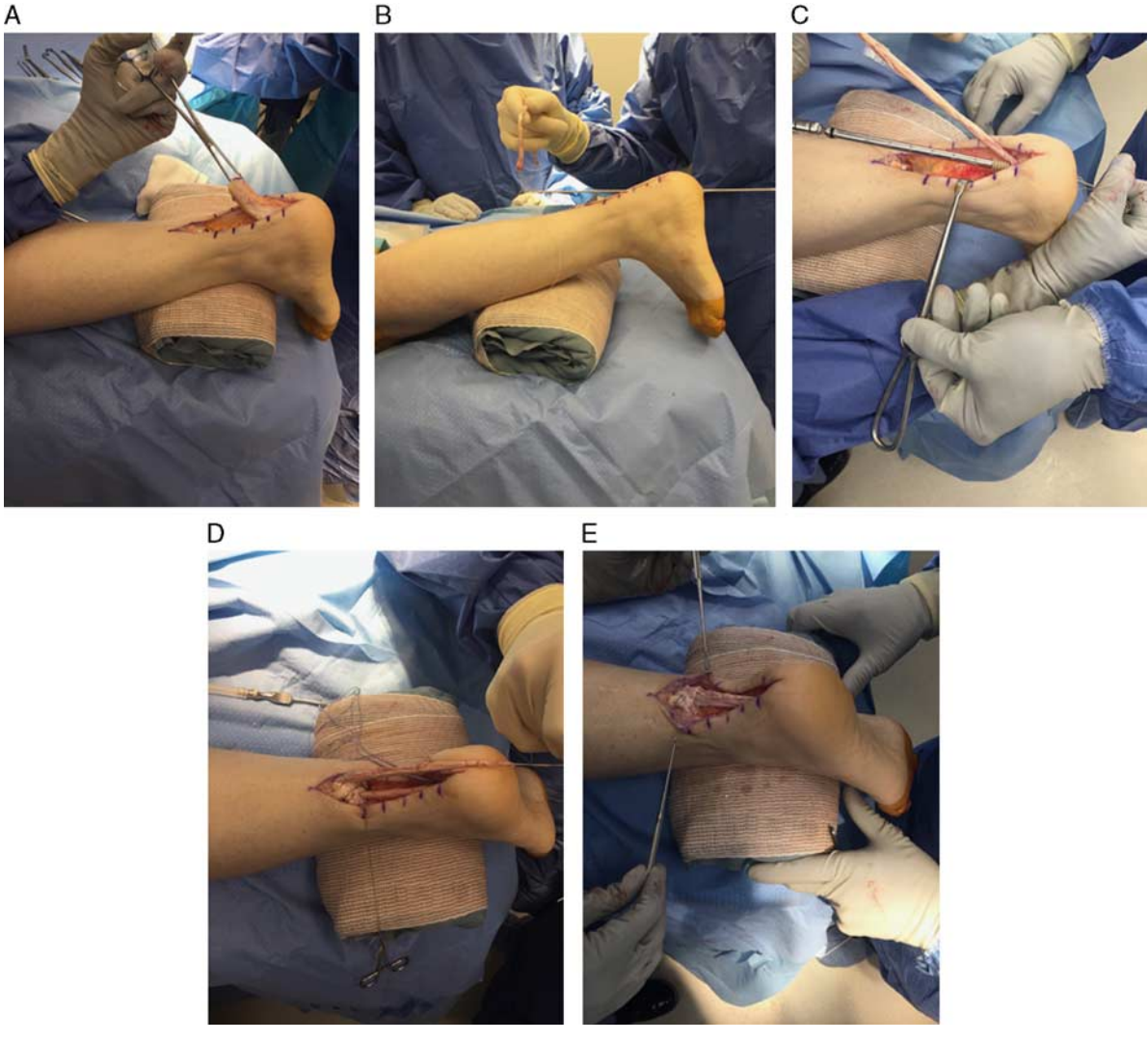
FIGURE 4. A, The distal stump is identified and removed. If the distal stump is intact and normal quality tissue, then we will not remove it. B, The hamstring graft is brought through a drill hole in the base of the calcaneus. C, The hamstring graft is secured in place with a Bio-Tenodesis screw. D, The hamstring graft is tensioned with the ankle in 10 to 15 degrees of plantarflexion. E, A pulvertaft weave is used to bring the hamstring graft back down. Using the whole hamstring graft, we are able to double the graft over and make it all the way down, where it is then secured in place.

anterior to the Achilles tendon. The tunnel does not go all the way through the calcaneus. The diameter of the tunnel should match the diameter of the prepared graft which is the overall diameter of the tubularized prepared tendon(s) that are being used. The harvested hamstring tendons are brought through the tunnel (Fig. 4B). If both the semitendinosus and gracilis are being used in combination, they will be tubularized together and should be brought through the tunnel together. They are fixed in place with a Bio-Tenodesis interference screw (Arthrex, Naples, FL). The screw should be the same size as the tunnel or, if it differs, 0.25 mm larger than the tunnel in order to ensure a strong bite (Fig. 4C). The hamstring tendons are then brought back proximally. They are tensioned with the ankle in 10 to 15 degrees of plantar flexion. A pulvertaft type maneuver is then used to bring the hamstring graft through the proximal Achilles stump (Fig. 4D). The tendon is then brought back down and tied to the stitches coming out of the Bio-Tenodesis screw and