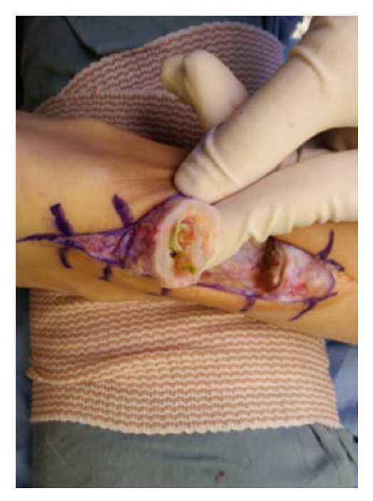
FIGURE 1. Chronic affected Achilles tendon.

original length and the patient will not be able to return to dayto-day activities. They will likely experience increased dorsiflexion pain and weakness, which is manifested by difficulty walking on their toes. When deciding which operative path to pursue, it is important to assess the area of tendon gap as well as the amount of tendinotic versus reusable tissue in the patient as well as to assess their calf muscle strength, size, and function. We recommended that if the gap is larger than 5 cm,<sup>13</sup> reconstruction should be performed with the use of a gracilis and semitendinosus autograft. If the patient is active and hoping to return to sports, an FHL transfer can also be performed to augment the reconstruction and allow for greater strength in the tendon postoperatively.