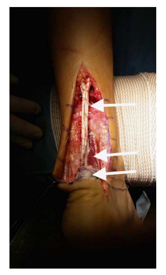
FIGURE 5. Patient with both a hamstring graft (top arrow) and FHL tendon transfer (middle arrow). The Achilles stump is indicated by the bottom arrow.

After the procedure, patients are placed in a nonweight bearing splint for 2 weeks. After 2 weeks, if the wound is healed, the sutures are removed and the patient is transitioned into either a cast or a CAM boot. If the wound has not healed, the patient is