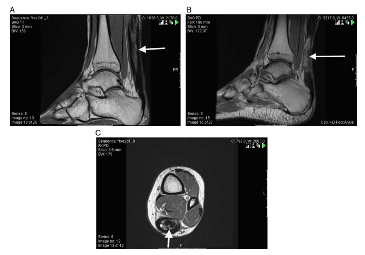
FIGURE 2. A and B, Sagittal MRIs showing high signal and severe tendinopathy (arrow) throughout the Achilles tendon. C, Axial MRI showing high signal and severe tendinopathy (arrow) in the Achilles tendon.

A bilateral Thompson test is performed, and positive results are noted to indicate an Achilles injury. Care is taken to observe the area of the Achilles, noting any swelling, tenderness to palpitations, as well as any palpable gaps. In addition to assessing pain, range of motion of the area is assessed. Special attention is paid to passive ankle dorsiflexion compared with the contralateral side. If dorsiflexion is increased, it can indicate attenuation of the tissue. Weight bearing anteroposterior, lateral, and oblique radiographs are obtained and assessed for overall alignment as well as any fractures in the area or to identify any tendinotic calcifications in the area. In addition,