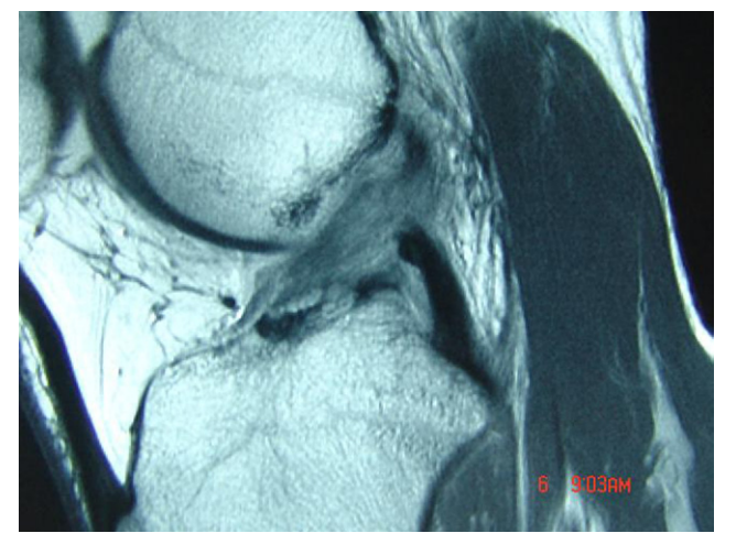
Figure 1 Sagittal MRI of a partially torn ACL with some fibers still in an appropriate orientation and a small bony avulsion of the femoral origin. (Color version of figure is available online.)

tion and the lack of an endpoint to the Lachman test. Despite a thorough physical examination, the diagnosis may still be questionable. This may be the case in partial ACL tears or revision settings where the endpoint may be soft. Other studies will become more useful in these situations.