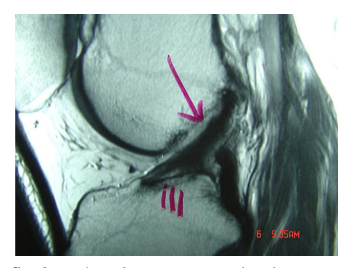
Figure 2 Sagittal MRI of patient in Fig. 1, 1 year later, demonstrating healing of the fragment and ligament. (Color version of figure is available online.)

If the presence of an ACL tear is more definitive, the question of whether the patient needs ACL reconstructive surgery arises. We base our recommendations on the particular needs