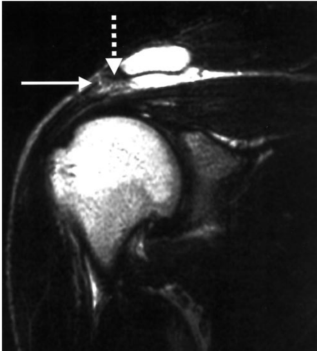
Figure 2. Partial deltoid muscle detachment (solid arrow) and heterotrophic bone in the deltoid muscle (dotted arrow).

the deltoid muscle. Our patient had no such history. There are a few reports of spontaneous deltoid muscle detachment in patients with chronic, massive rotator cuff tears. 1,3-5 In this patient population, functional disability,