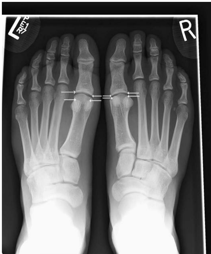
Figure 1. Standing anteroposterior radiographic view of the feet. Note the increased distance between the first metatarsophalangeal joint and the sesamoids on the injured left foot versus the right foot.

(ROM) program. He began plyometrics at 16 weeks. He returned to full participation in football at 6 months. The complete postoperative regimen is diagrammed in Table 1. At final follow-up, his dorsiflexion ROM was 63° in the involved toe and 70° in the contralateral toe.