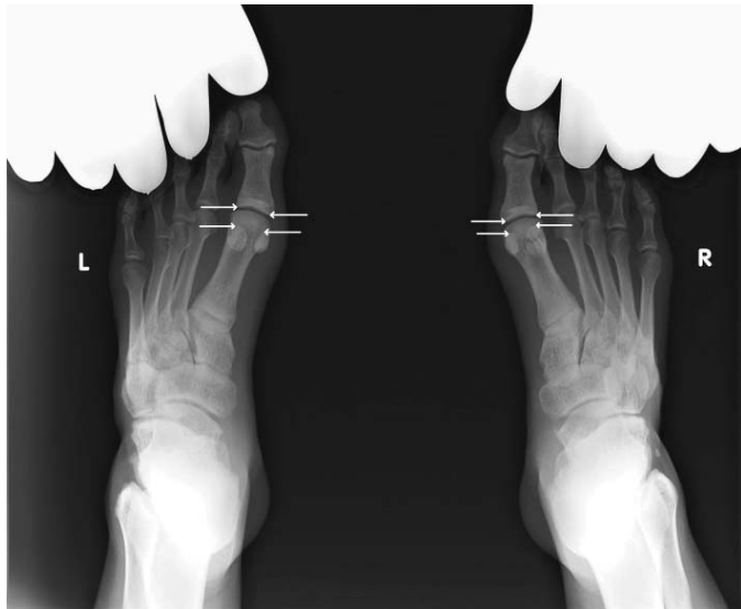
Figure 6. Dorsiflexion stress anteroposterior radiographic view of the feet showing only minimal retraction of the sesamoids on the injured left foot.