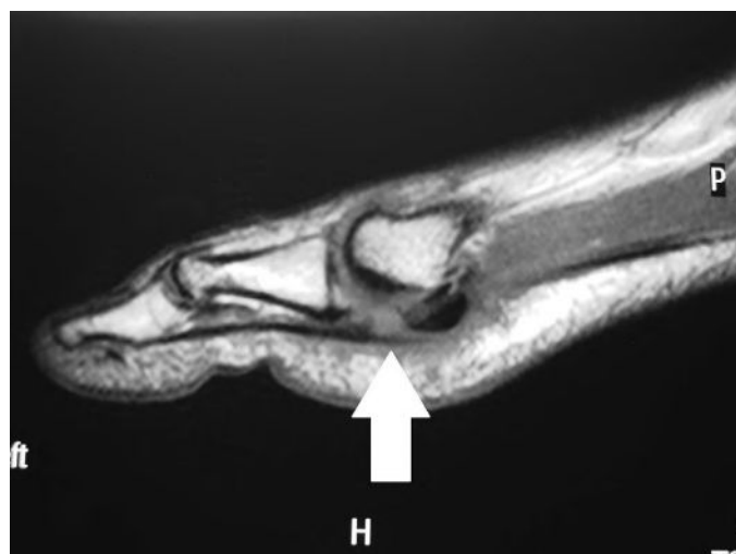
Figure 4. Magnetic resonance image of the toe demonstrating a complete tear of the plantar plate.

medially and laterally. 3,4 The medial and lateral collateral capsular ligaments provide varus and valgus stability. The medial flexor-tendon complex comprises the medial head of the FHB and the abductor hallucis tendon as they envelop the medial sesamoid to attach to the medial proximal phalanx. The lateral flexor-tendon complex comprises the lateral head of the FHB and the adductor hallucis tendon as they envelop the lateral sesamoid to attach to the lateral proximal phalanx. The sesamoids serve as a fulcrum to increase the lever arm of the FHB tendons and augment the plantar-flexion strength of the first MTPJ. 5 The flexor hallucis longus (FHL) tendon courses in a separate sheath between the sesamoids and attaches to the distal phalanx. The plantar plate is a fibrocartilaginous structure formed by the thickened plantar-joint capsule and medial and lateral flexor-tendon complexes that courses from the first metatarsal head and attaches to the proximal phalanx. These soft tissue stabilizers allow for approximately 50° of dorsiflexion and 30° of plantar flexion. 4