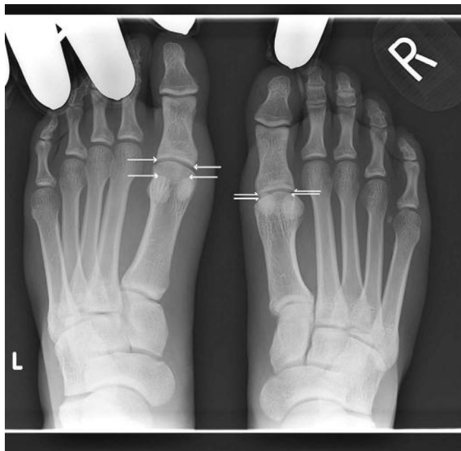
Figure 2. Stress anteroposterior radiographic view of the feet. Note the increase in distance between the first metatarsophalangeal joint space and the sesamoids on the injured left foot versus the right foot.

Given the positive findings on stress radiographs and his desire to continue participating in sports at a high level, we performed surgery. A medial incision revealed a complete disruption of the plantar plate and proximal retraction of the sesamoids (Figure 5). Scar tissue was debrided. We placed drill holes through the sesamoids and then sutured them to the distal plantar-plate tissue, which had remained intact. A Kirschner wire was used to hold the toe in approximately 10° of plantar flexion to relax the soft tissue repair. The pin was removed 2 weeks after surgery, and the athlete was