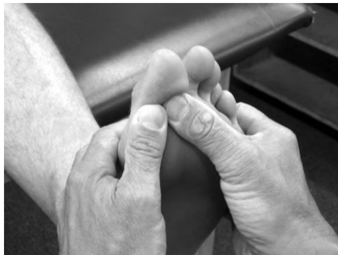
Figure 8. Isolated strength testing of the flexor hallucis brevis by stabilizing the hallux interphalangeal joint.

For unstable injuries, the treatments are less well defined. Fractures have been treated in a variety of ways, including nonoperatively. For displaced fractures in which the plantar-plate apparatus has been rendered incompetent, some authors 3,13,14 have proposed excising the smaller