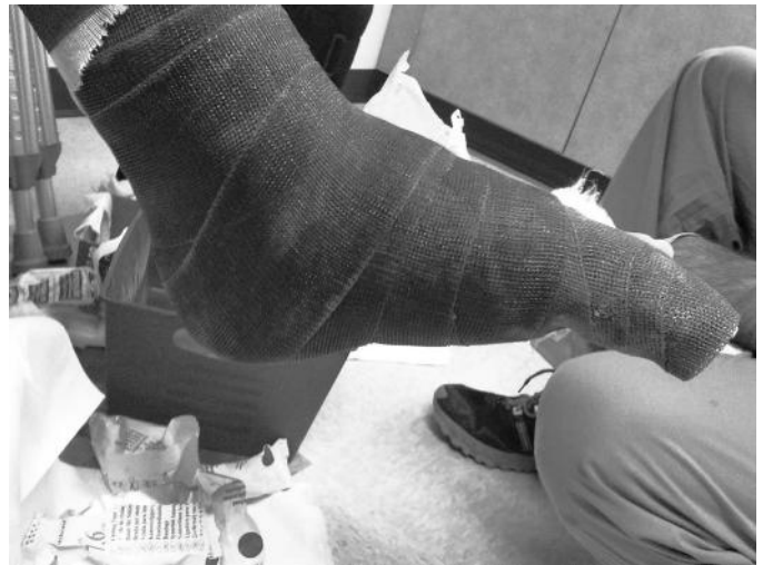
Figure 7. Cast with the great toe in plantar flexion.

In lieu of or in addition to an isolated soft tissue injury, the sesamoids can be injured. 7–10 They can sustain fractures that may be displaced or injuries to the synchondrosis if the sesamoids are bipartite or tripartite. Given that the sesamoids are intra-articular bones, they may sustain injuries to their articular surfaces as well. These first MTPJ injuries also can include die-punch injuries, shear injuries, or even bone marrow edema analogous to what can occur in the knee with an anterior cruciate ligament tear. Such damage can produce a loose body within the joint itself. Any of these exacerbating factors (eg, bone marrow edema, loose body) may lead to chronic sequelae, such as stiffness, early MTPJ arthrosis, and pain. Furthermore, injury to the plantar plate and FHB tendons may decrease first MTPJ competence and push-off strength, which can affect performance, particularly in sprinters and elite-level athletes participating in cutting sports. 11–14