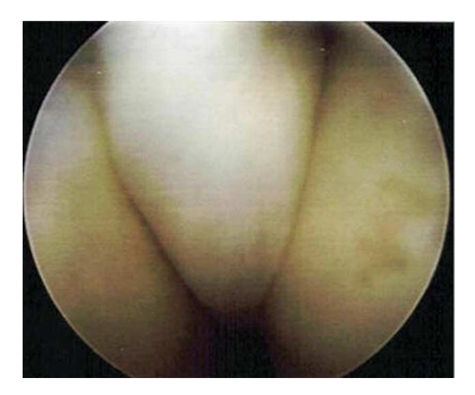
FIGURE 3. This is an arthroscopic active compression test performed in a patient with clicking and mechanical symptoms, but without pain. Subluxation of the tendon within the joint is evident, but because the clicking was not painful no intervention was performed.

commonly accepted that the biceps tendon can play an important role in shoulder pathology and serve as a major pain generator within the shoulder.