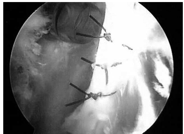
FIGURE 5. Arthroscopic view of the completed repair.

The elbow is then put through a full range of motion while visualizing the repair. Although this tensioning technique was empirically derived, it appears to give a repair that is isometric with little to no tension with elbow motion. The senior author has performed approximately 30 of these transfers to date. We had the occasion to perform a second arthroscopy on 2 transfers that we had performed using an arthroscopic-assisted technique (before this current technique) for removal of scar tissue. In both cases, there was complete healing of the transfer and no Popeye sign (Fig 6). We have had no cases of painful scarring to date with this current all-arthroscopic technique.