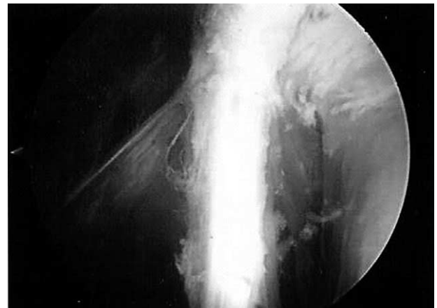
FIGURE 3. Arthroscopic view of the conjoint tendon as visualized from the anterolateral portal.

space is carefully cleared to expose the conjoint tendon medially and short head of the biceps (Fig 3). This space is then further cleared down inferiorly to the pectoralis major muscle and then laterally to the pectoralis major tendon, which will insert lateral to the biceps tendon. A spinal needle is then used to localize a superior, anterolateral portal in line with the bicipital groove. This portal is created using a knife while viewing from the posterior intra-articular portal. At this point, the arthroscope is advanced to view down the bicipital sleeve to allow as much release of the bicipital sleeve as possible from the superior, anterolateral portal with an arthroscopic scissors or arthroscopic banana blade. Arthroscopic cautery with a bi-