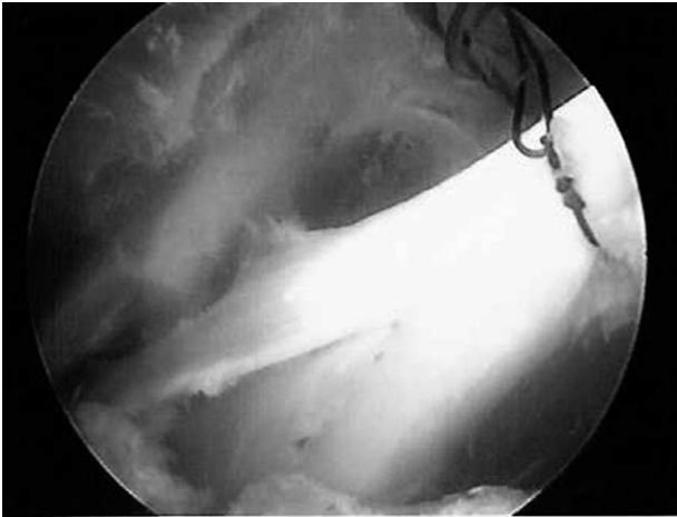
FIGURE 4. Arthroscopic view of the long head biceps tendon being tensioned alongside the conjoint tendon.

polar radiofrequency device (Arthrocare, Sunnyvale, CA) is used to coagulate any local bleeding.