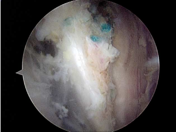
FIGURE 6. Arthroscopic view of a completed repair at the 2-year follow-up. The long head biceps has completely healed to the conjoint tendon.